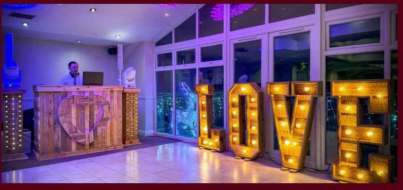
Rustic With Heart