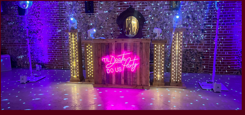
Rustic With Neon