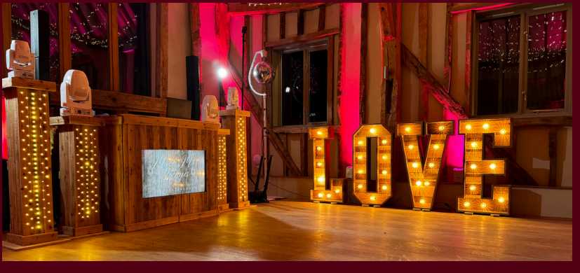
Rustic With TV Screen

A CHOICE OF ANY OF THESE WITH YOUR PACKAGE