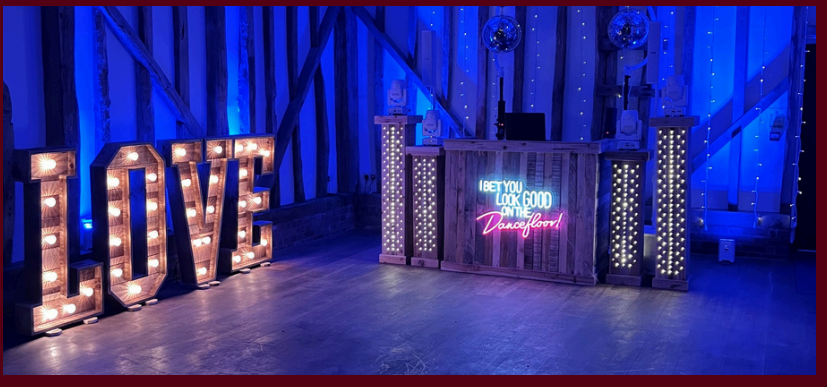
Rustic With Neon